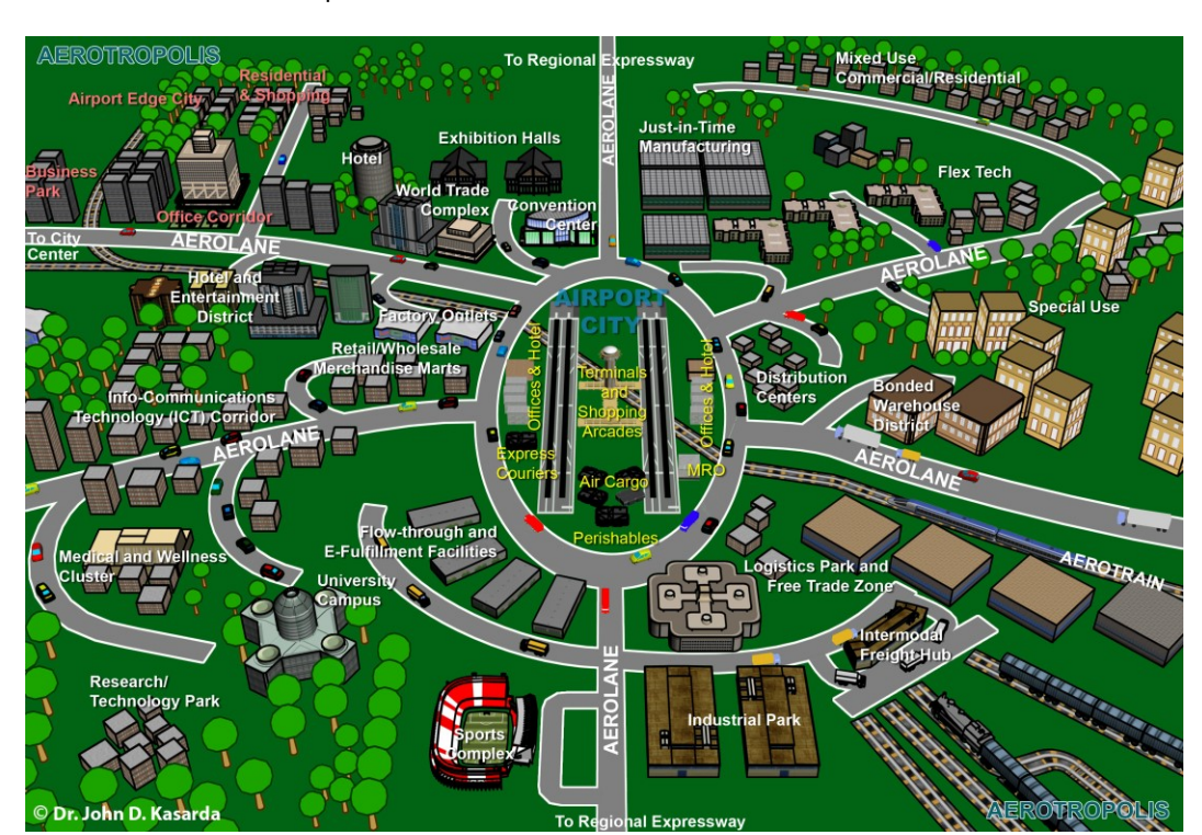
Exhibit 1: General aerotropolis schematic