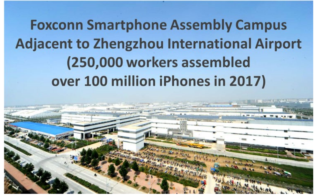
Exhibit 3: Foxconn assembly complex at the ZAEZ

The growth in the ZAEZ's smartphone production has been complemented by substantial additions of firms in seven other modern industry clusters. During 2017, the aviation logistics industry cluster attracted 36 firms with total investment of 29 billion RMB (4.2 billion USD) with estimated annual revenue of over 50 billion RMB (7.5 billion USD). The e-commerce industry cluster drew 431 firms, of which 338 were registered as cross-border e-commerce firms, with another 12 whose facilities were still under construction.