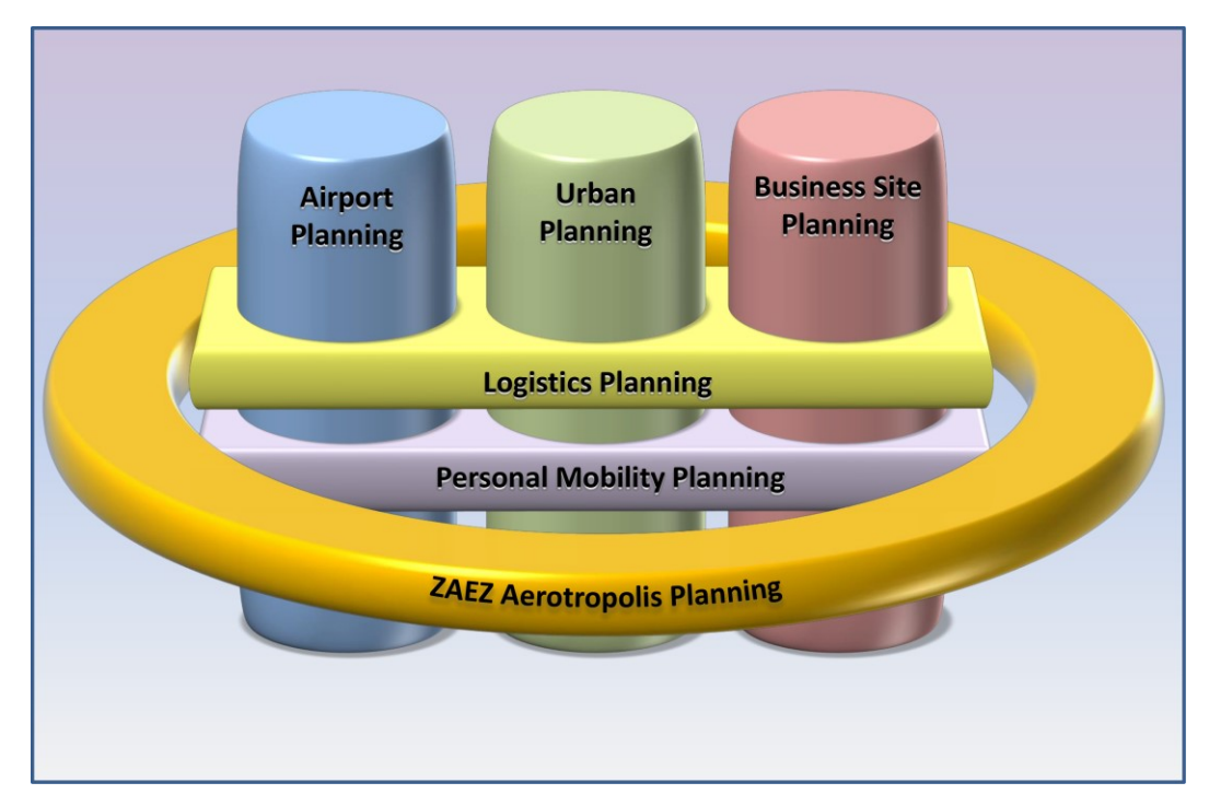
Exhibit 2: ZAEZ's golden ring of aerotropolis integrated planning

precisely as envisioned by the State Council in 2013, the ZAEZ is catalyzing numerous sectors throughout the Zhengzhou metropolitan region and greater Henan Province. These range from aircraft leasing, cross-border e-commerce, perishables distribution, and tourism to aerospace component manufacturing, biomedicine, financial services, and smartphone assembly.