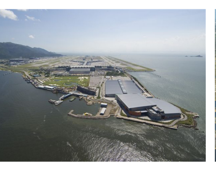
Hong Kong Sky City, Hong Kong International Airport.