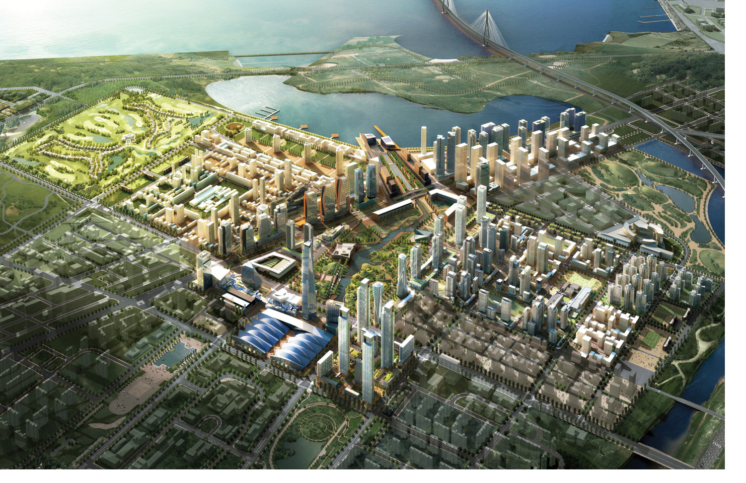
New Songdo International Business District (Near Incheon International Airport).